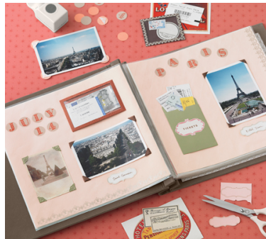
This is a scrapbook .