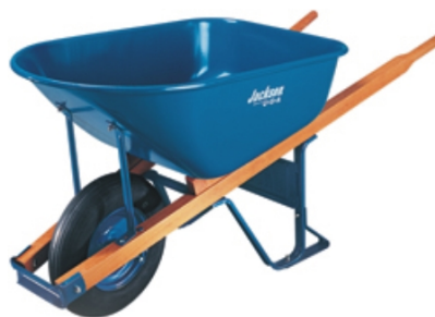
This is a wheelbarrow .