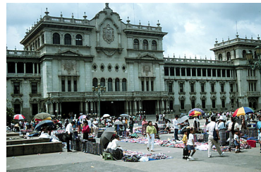
This is a plaza .