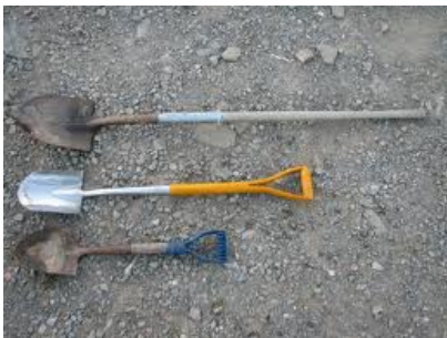
These are shovels .