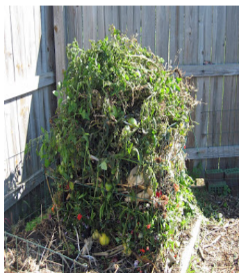
This is piled high .