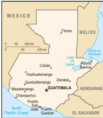
This is Guatemala .