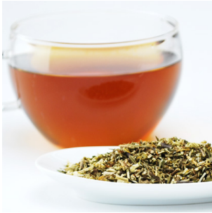
This is goldenrod tea .