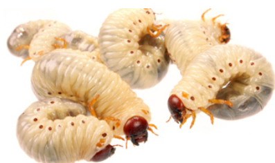
These are maggots .