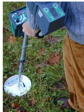
This is a metal detector .