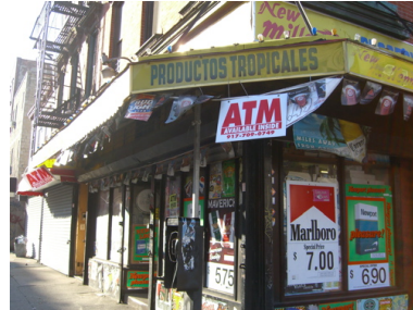
This is a bodega .