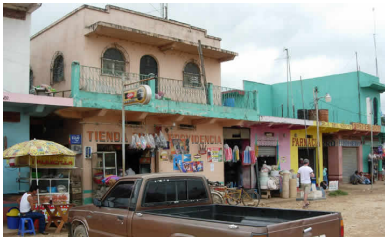
This is a pueblo .