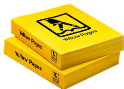
This is a phonebook .