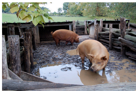
These are hog pens .