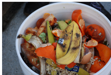
These are kitchen scraps .