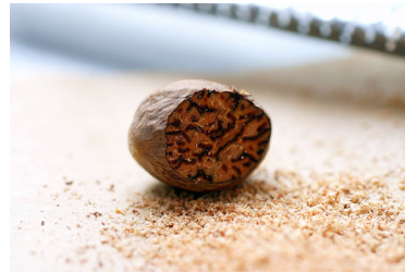
This is nutmeg .